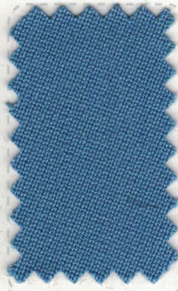
09 Powder Blue