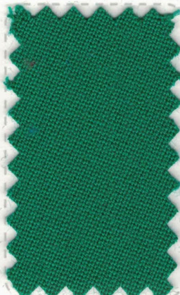
06 Yellow Green