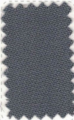
19 Shark Grey