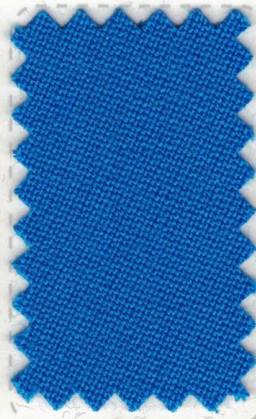
08 Electric Blue