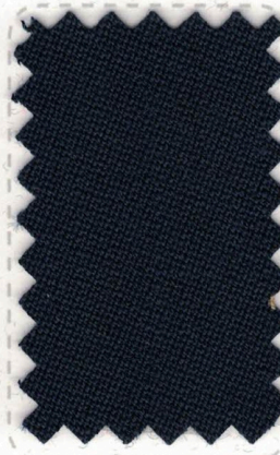
20 Navy Blue