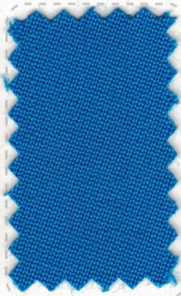
04 Tournament Blue